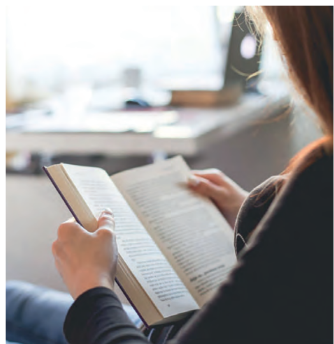
Images are indicative only and are taken from previous Redrow show apartments.