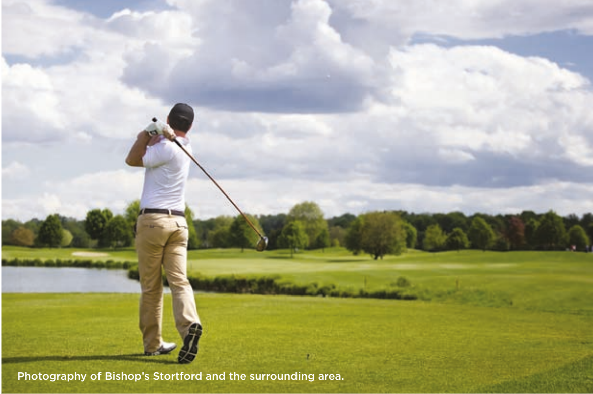
Photography of Bishop's Stortford and the surrounding area.