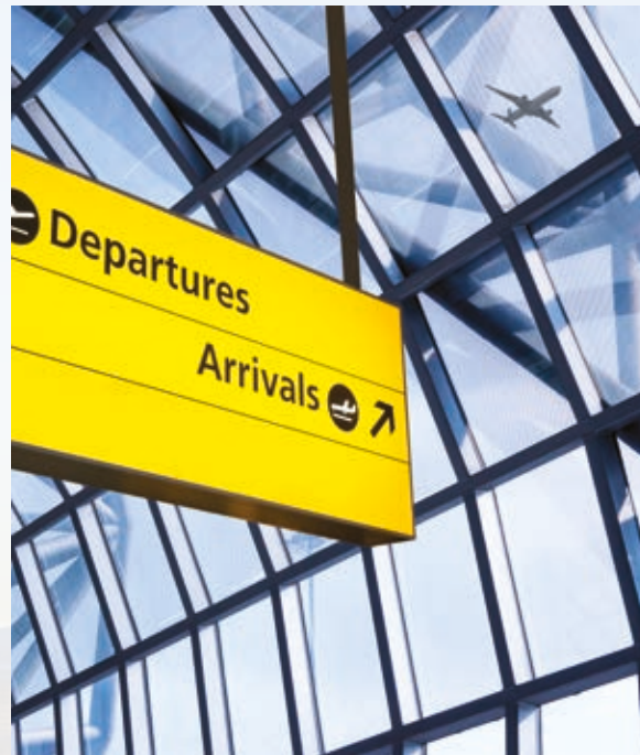
// STANSTED AIRPORT