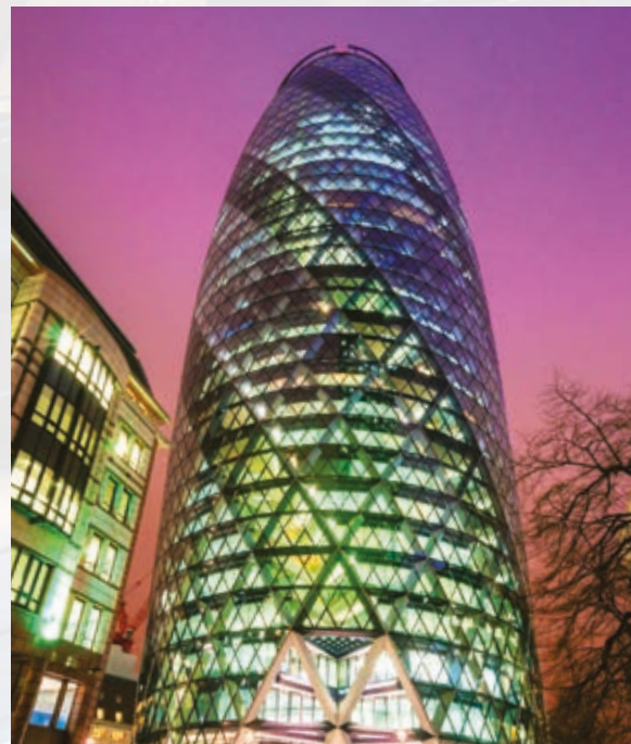
// THE GHERKIN NEAR LONDON LIVERPOOL STREET