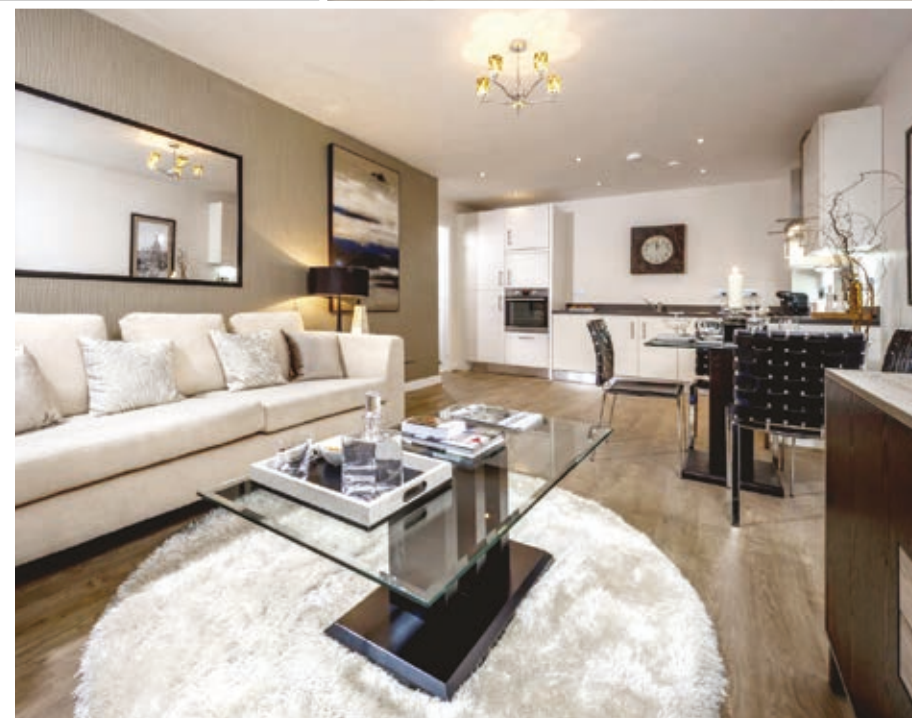
Images depict previous Redrow developments.

It's a place where memories will be made, and a place which you'll be happy to call home for many years to come.