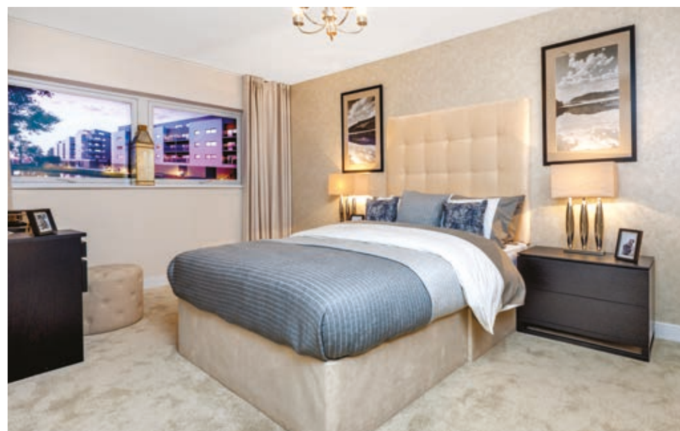
Image depicts previous Redrow development.

A number of the apartments at Regent's Court have Juliet balconies, meaning that in the summer months the doors can be thrown open for sunshine to stream into your home. And, of course, the changing beauty of the seasons can be viewed all year round from all the apartments thanks to their expansive windows.