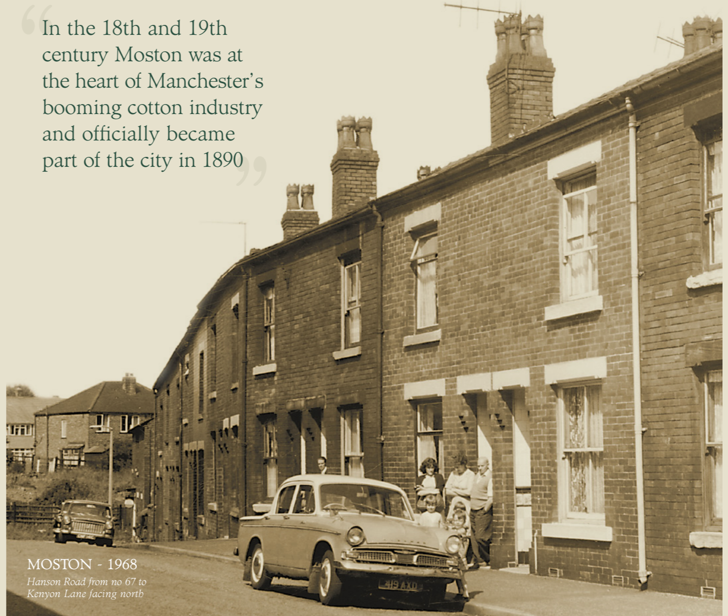
MOSTON - 1968 Hanson Road from no 67 to Kenyon Lane facing north