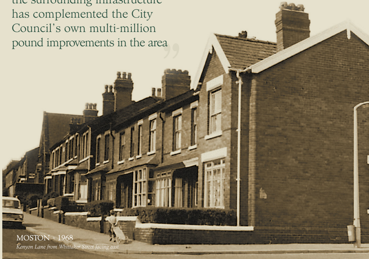
MOSTON - 1968 Kenyon Lane from Whittaker Street facing east

Redrow's provision of new homes, and investment in the surrounding infrastructure has complemented the City Council's own multi-million pound improvements in the area