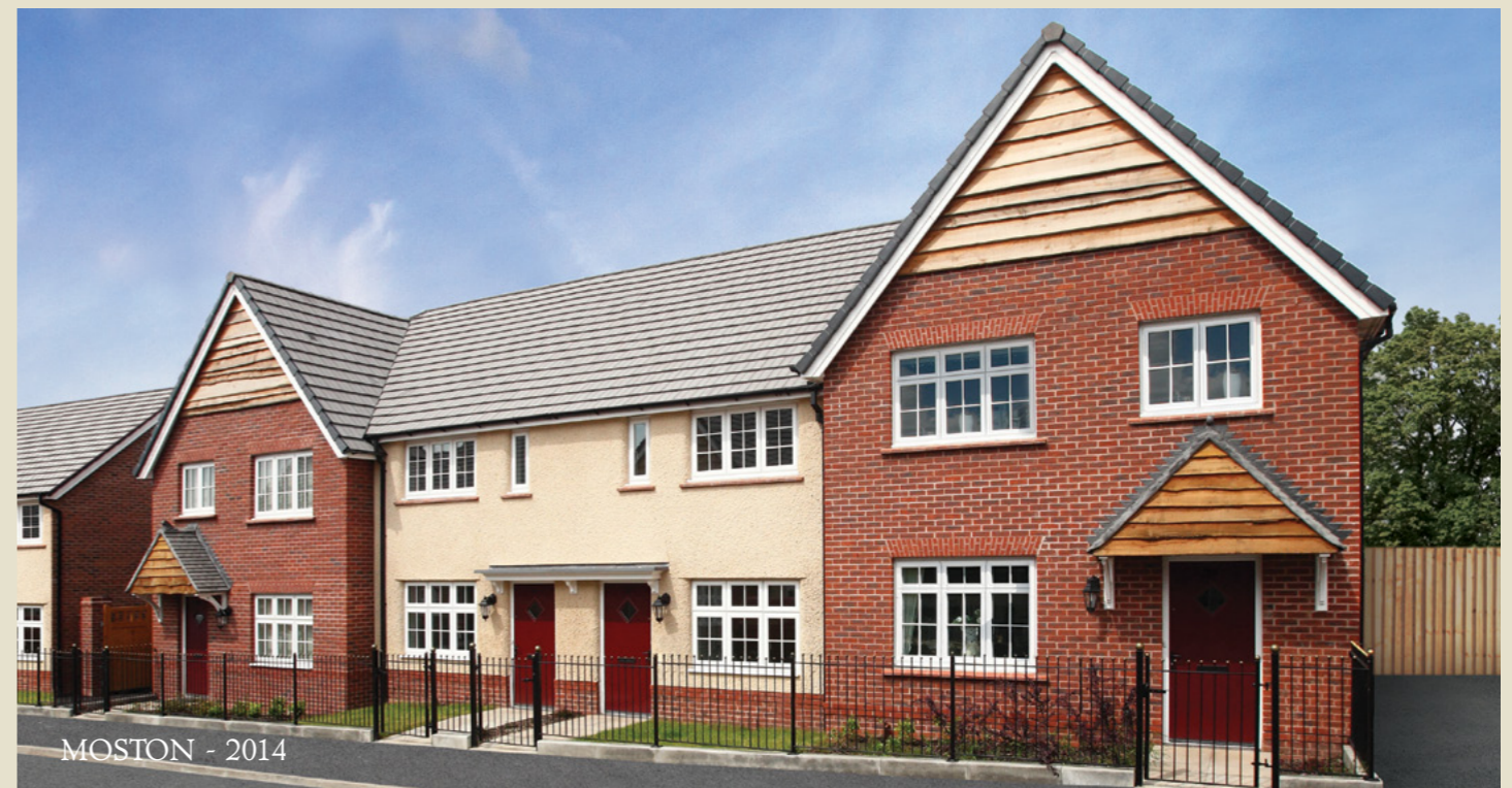
MOSTON - 2014

“In the 18th and 19th century Moston was at the heart of Manchester’s booming cotton industry and officially became part of the city in 1890”