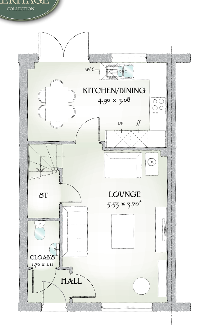
908 SQ FT | THREE BEDROOM HOME

S imple, yet stylish, compact yet undeniably chic, these superb homes offer the perfect combination of quality and value, space and savings, all created with the same high levels of craftsmanship that set all Redrow Homes apart.