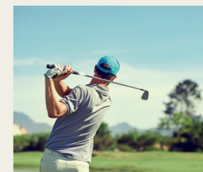
SITTINGBOURNE GOLF CLUB