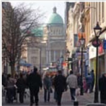
Hull City Centre

At Redrow, we take great pride in every detail, from carefully selecting the location of your new home to building it with high quality materials. Plus we're totally committed to creating an environment which lives up to the many demands of today's lifestyles. Long after you've settled into your new home, we'll continue to invest in the community to create a pleasurable living environment for many years to come. Throughout the whole buying process and after completion, our expert team of friendly customer service staff will ensure choosing a Redrow home is the most reassuring choice you can make.