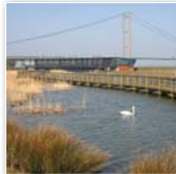
Waters' Edge visitor centre, Barton