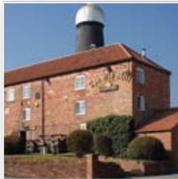
The Old Mill in Barton