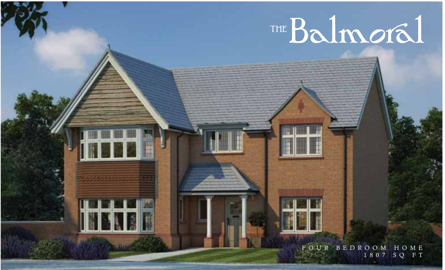
FOUR BEDROOM HOME 1807 SQ FT