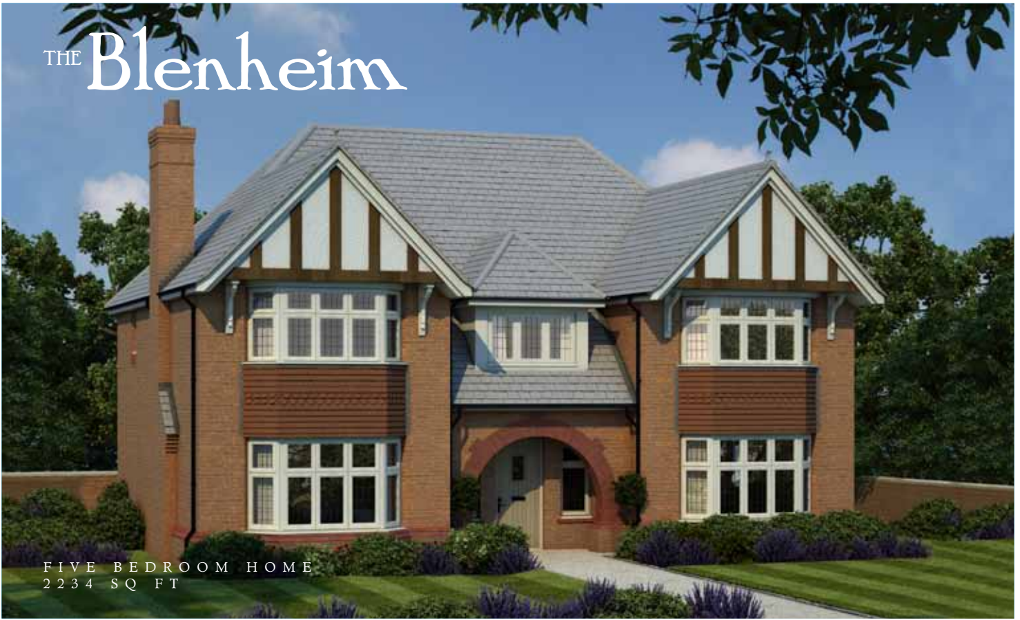
FIVE BEDROOM HOME 2 2 3 4 SQ FT