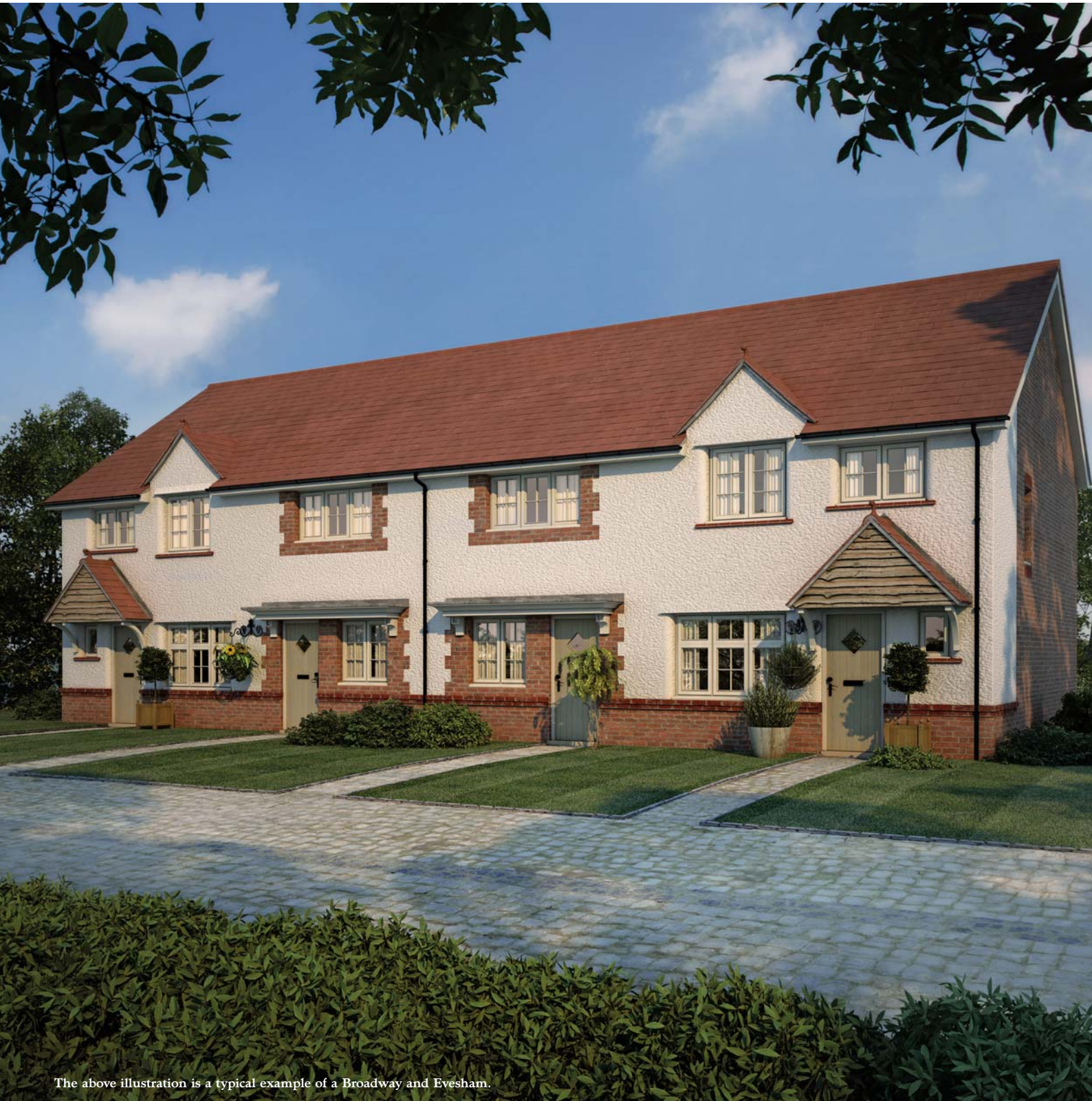
The above illustration is a typical example of a Broadway and Evesham.