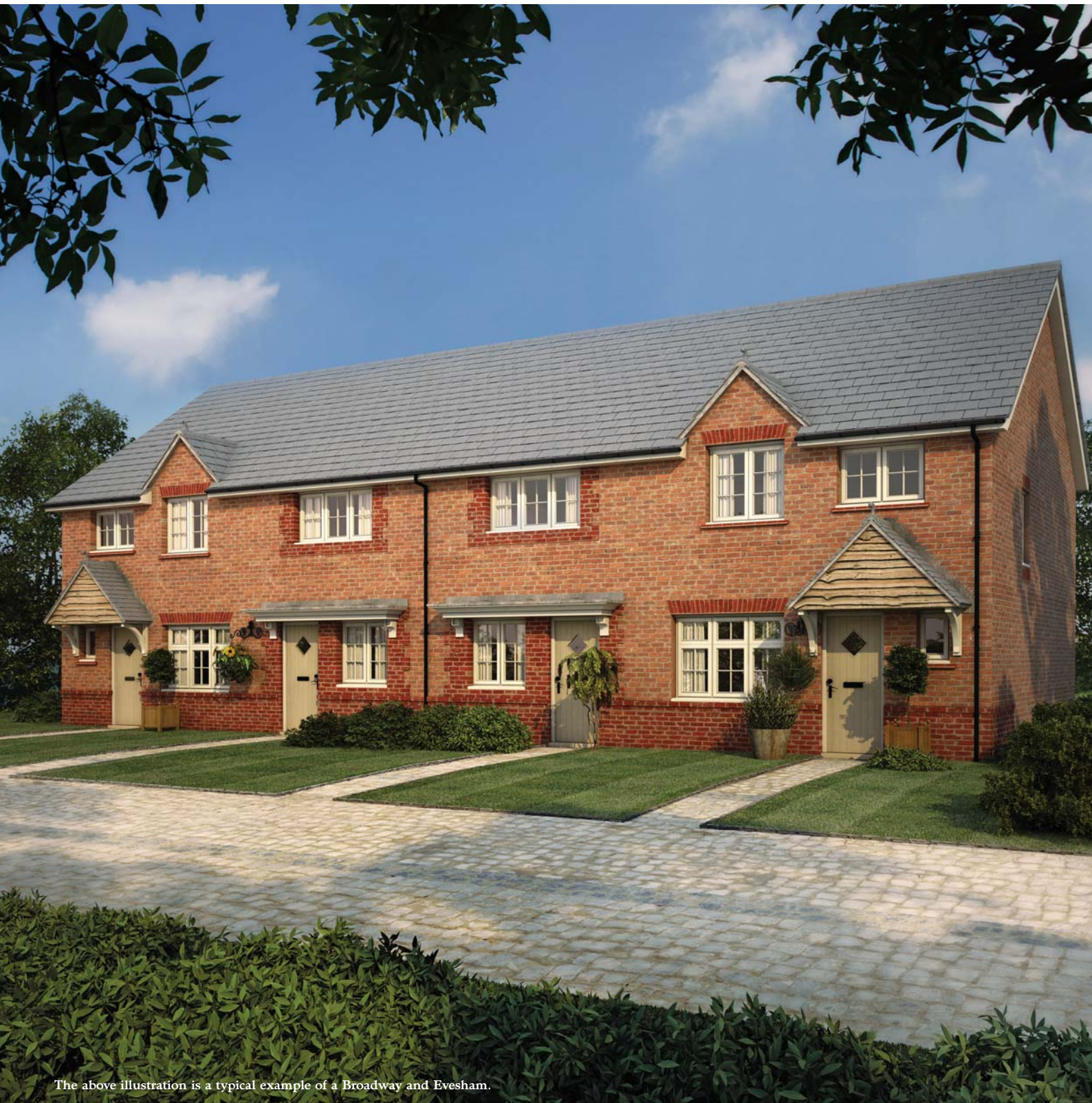
The above illustration is a typical example of a Broadway and Evesham.