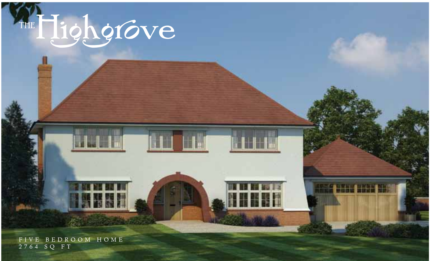
FIVE BEDROOM HOME 2764 SQ FT