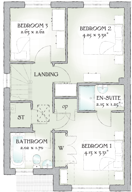
THREE BEDROOM HOME

†Additional window to plot 38, 39, 47 & 68